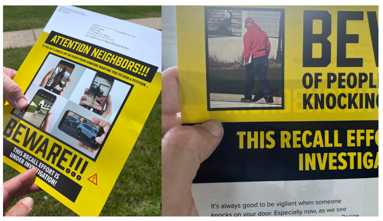
Caption: The mailer includes photos of recall workers taken without their knowledge

The mailer warns people to "BEWARE" if you "get a knock on the door from someone wanting you to sign a petition. The mailer claims, without any apparent proof, that "this recall effort is under investigation."